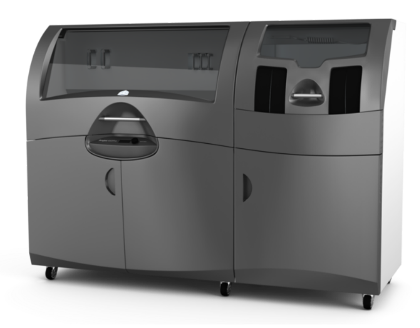
The CJP 660 Pro prints in gypsum powder with full CMYK color capabilities.

If you are interested in learning more about these new 3D printers, please check in with digital lab staff!