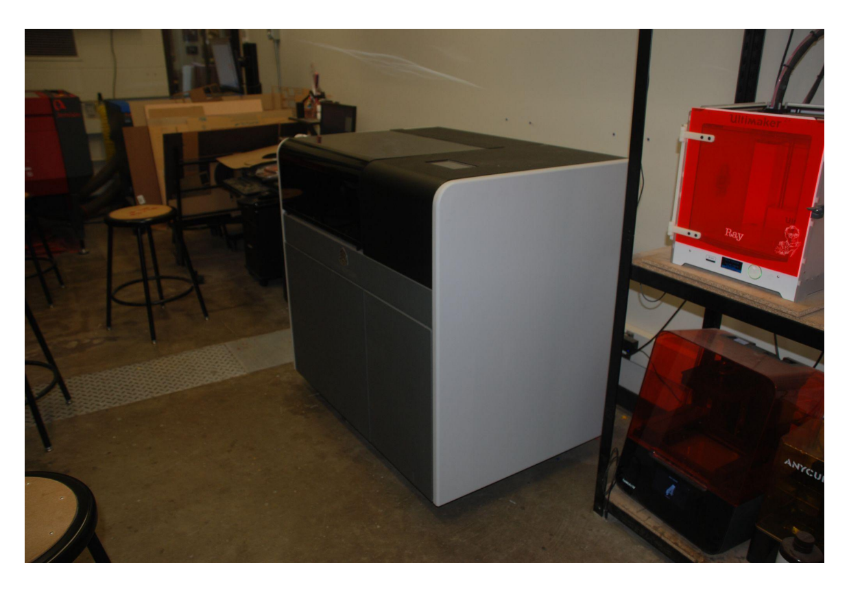
The Projet MJP 2500 prints in clear resin with a wax based support structure.