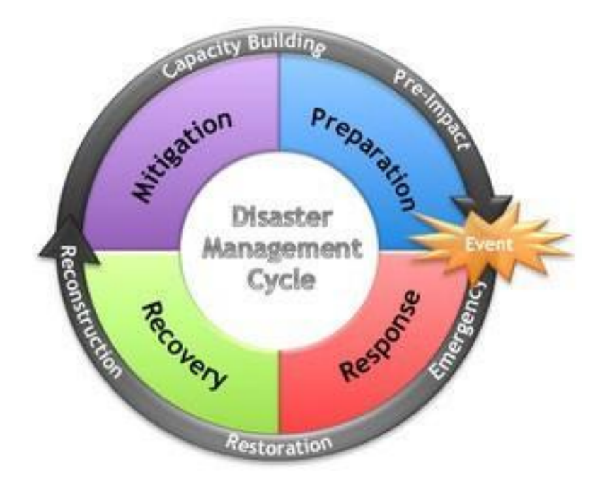
Figure 2: Four Phases of Emergency Management in the Disaster Cycle