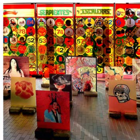
Eric J. Garcia, War Nest , 2019, Wood, acrylic paint and screws, 4' x 12' diameter