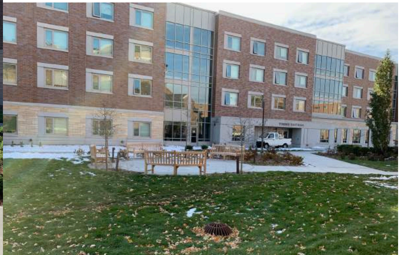
Site Photographs, memorial base shown on left